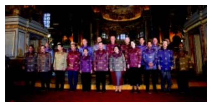
APEC Leaders at the Ananta Samakhorn Throne Hall, Bangkok, Thailand on 21 Oct 2003

Website: www.mofa.go.jp/policy/economy/apec/2002/activity.html "