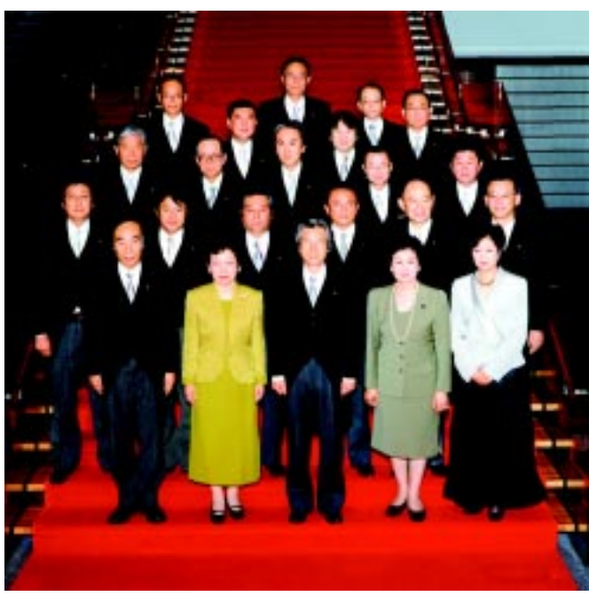
Prime Minister Koizumi's Cabinet

index.nsf/html/index_e.htm Foreign Press Centre: www.fpcj.jp