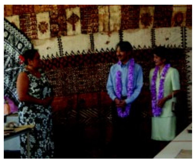
Prince and Princess Akishino visit the National University of Samoa (Home Economics Department)

The Prime Minister later hosted a dinner in their honour at Aggie Grey's Hotel.