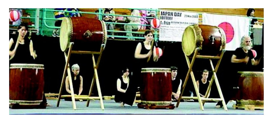
Taiko drum group, "Waikaito", giving a rousing performance at Japan Day in Auckland.

and participants throughout the day. Other attractions included food stalls, selling traditional Japanese festival-style snacks, mochitsuki (rice-cake making), and an Ikebana display.