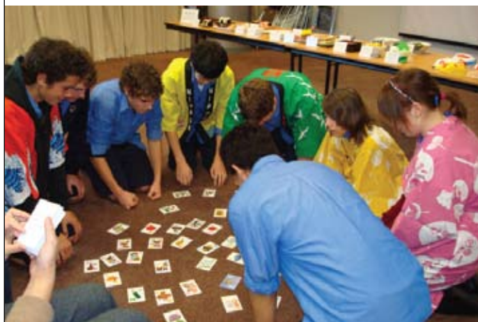
10 students and a teacher from the Feilding High School Japanese class visited our Information and Cultural Centre on 14 May 2009. The school visits us annually to participate in the activities we offer to learn about Japan and Japanese culture. The students and teacher enjoyed their school visit.

http://www.nz.emb-japan.go.jp/culture_education/archive.htm#schoolvisit