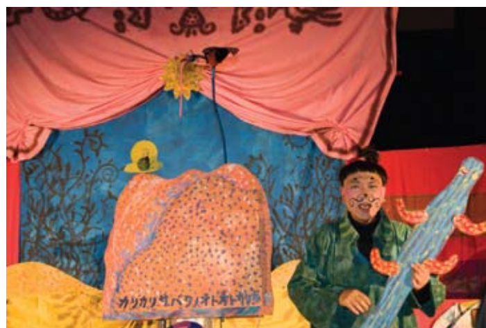
Japanese musical puppetry performance by Dalmamori and Eriko.