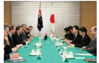
Japan - New Zealand Prime Ministers' Meeting