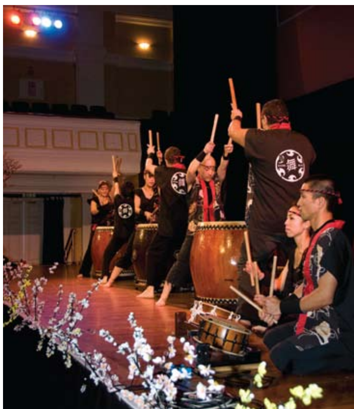
Haere Mai Taiko drum team from Auckland.