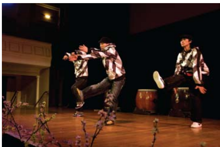
The Natural High Dance Team from Sydney’s Dancekool studio.

The next Japan Festival of Wellington is to be held on 5 September 2010.