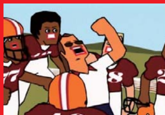
The World of GOLDEN EGGS ©PLUS heads inc.