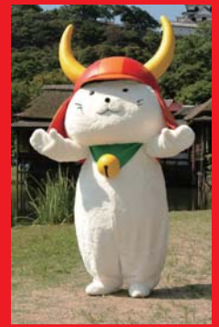
Hikonyan

What exactly is a character? Why are they so popular? What kind of society do these characters reflect and what kind of influence do they exert on that society? And finally, where is Japanese character culture headed? In this exhibition, as we introduce the intimate relationship between characters and Japanese people, we hope that the visitors will gain a better understanding of the cultural and historical background behind the Japanese love of characters as well as the future of characters in contemporary Japan.