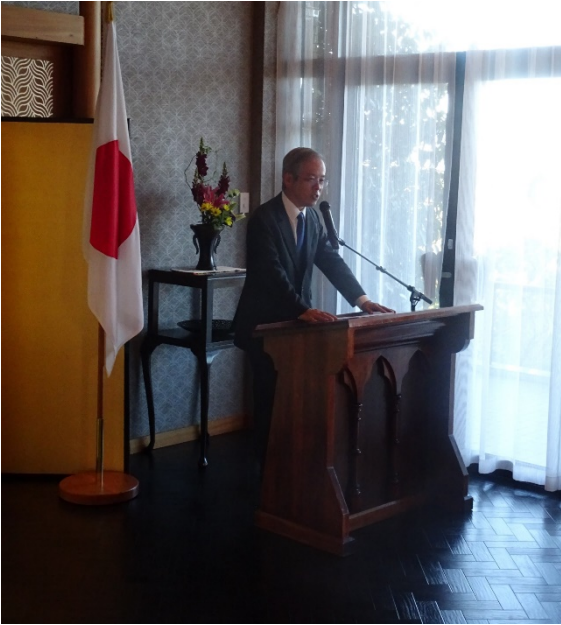
Congratulatory Remarks by Ambassador Ito 伊藤大使祝辞