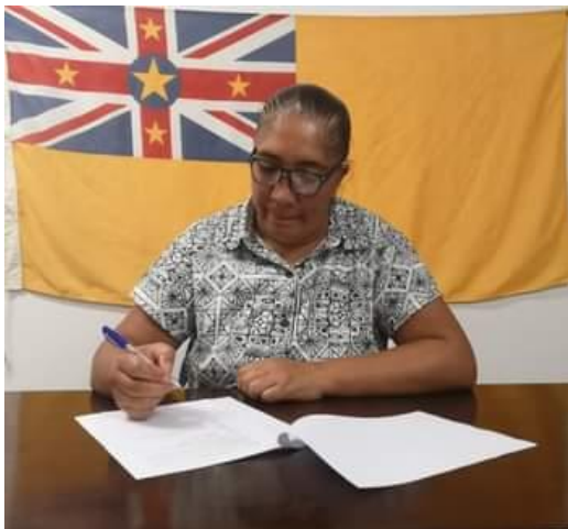
Director General Gaylene Tasmania

The Project is also expected to help achieve a 100 % immunization rate for the national school vaccination programme and to control and manage the examination and treatment of Rheumatic illness and cardiac diseases through urgently needed medical equipment.