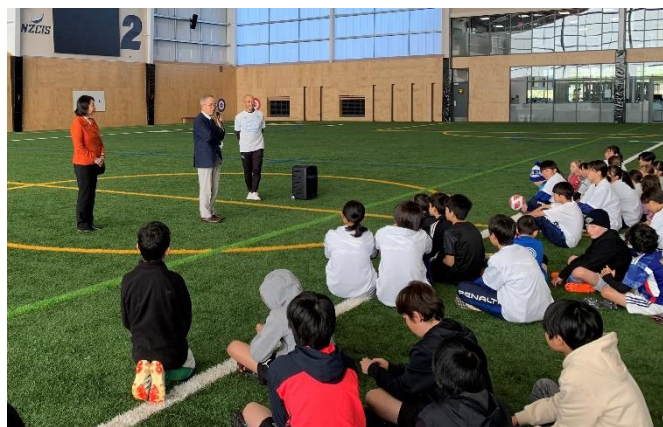
Remarks by Ambassador ITO Koichi