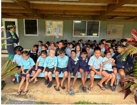
Students gather for the celebration