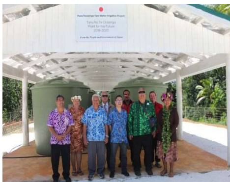
Water tanks in Puna Tavaenga village in Mangaia