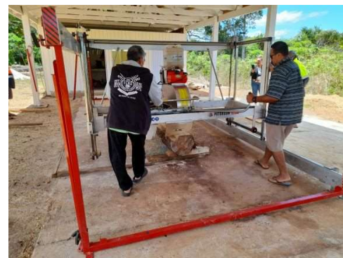
Sawmill training at the facility for Forest Resources Management in Mangaia