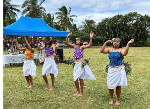
Dance performance by Imanuela Akatemala school students