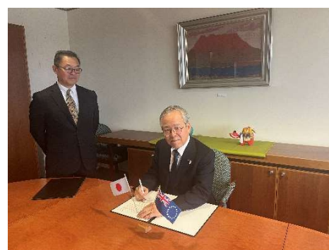
ITO Koichi Ambassador of Japan to Cook Islands