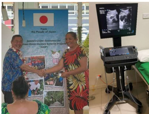
“The Project for the Upgrade and Provision of Equipment for the Niue High School Health Clinic”