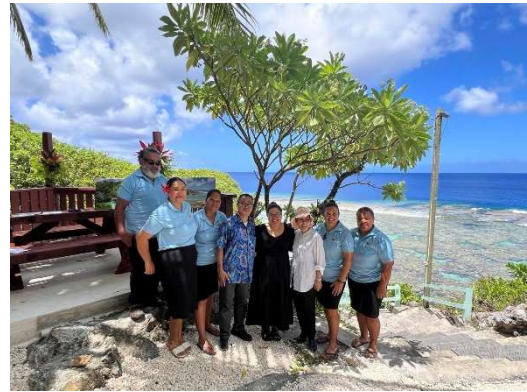
“The Project for the improvement of the Sea Tracks and Marine facilities in the western region of Niue”