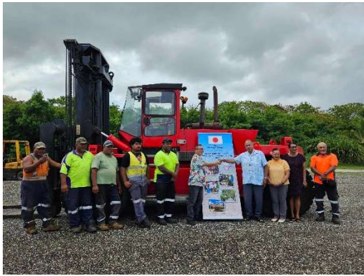
“The Project for Procurement of Cargo Handling Forklift in Alofi Port”