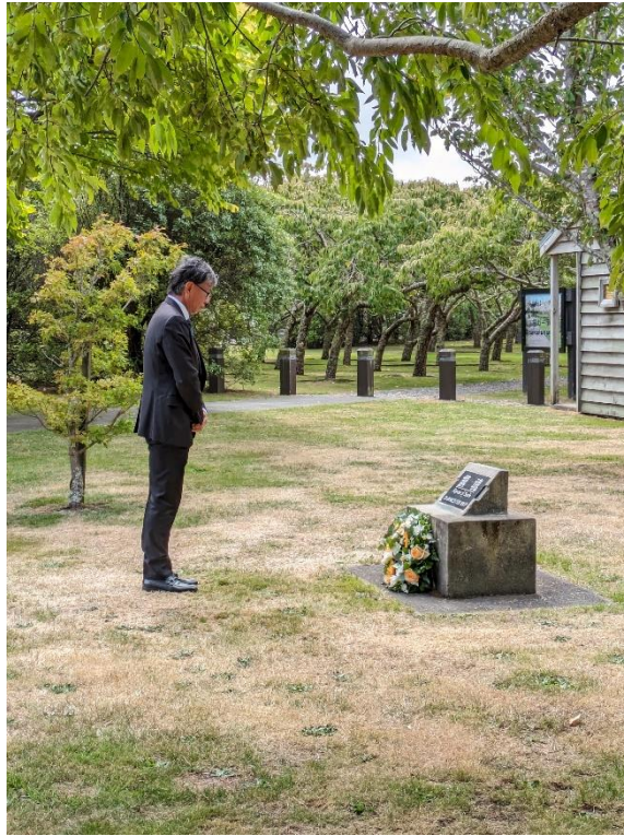
Laying wreaths to the Japanese Memorial