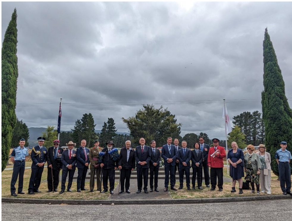
Photo with Participants