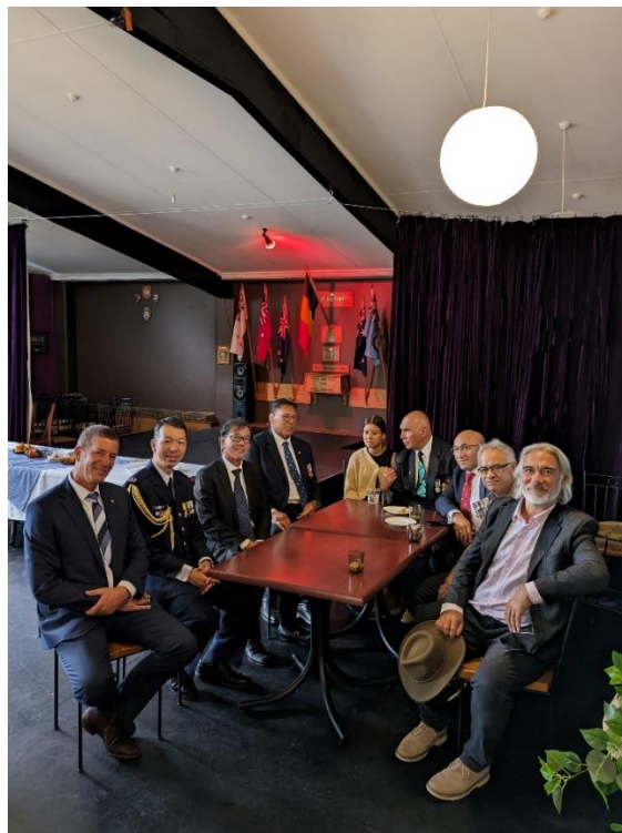
Photo with participants after the commemoration