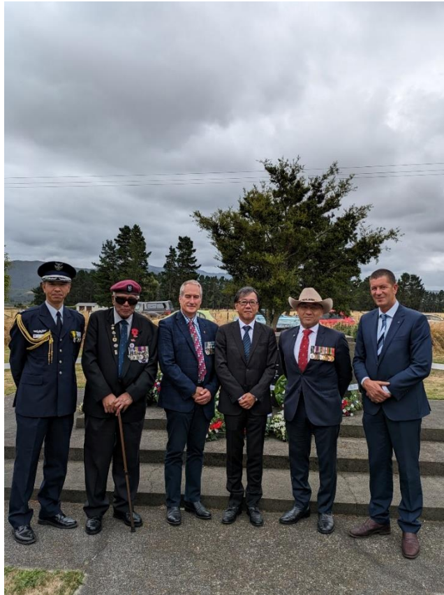
Photo with Participants