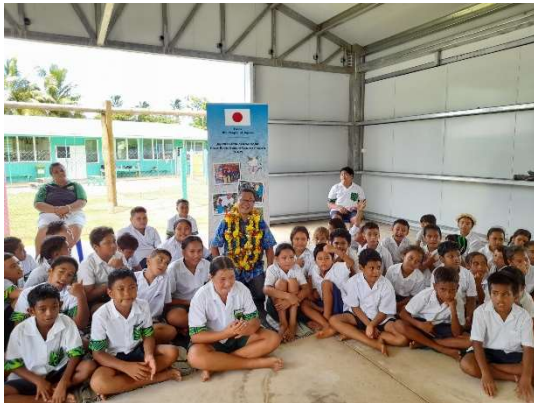
Hand-over ceremony for “Project for the Construction of the Araura Primary School Multipurpose Hall and Cyclone Shelter”