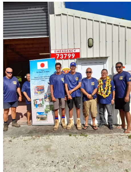
Hand-over ceremony for “Project for the Establishment of the Fire Rescue Station and Provision of fire Trucks to Aitutaki”