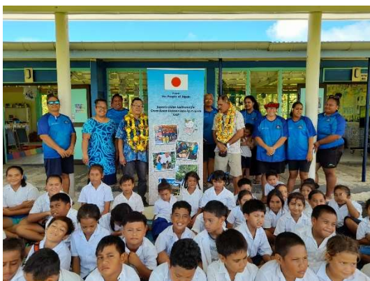
Hand-over ceremony for “Project for Development of Safe Outdoor Area for Early Childhood Education of Vaitau School”