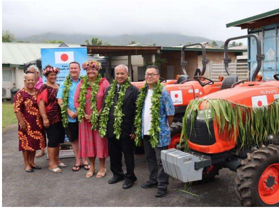
Hand-over ceremony for “Project for Provision of Agricultural Machineries in Rarotonga Island”