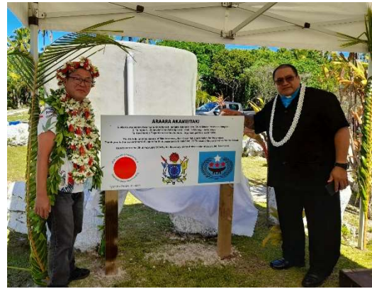
Hand-over ceremony for “Project for Establishment of Water Tanks in Mauke Island”